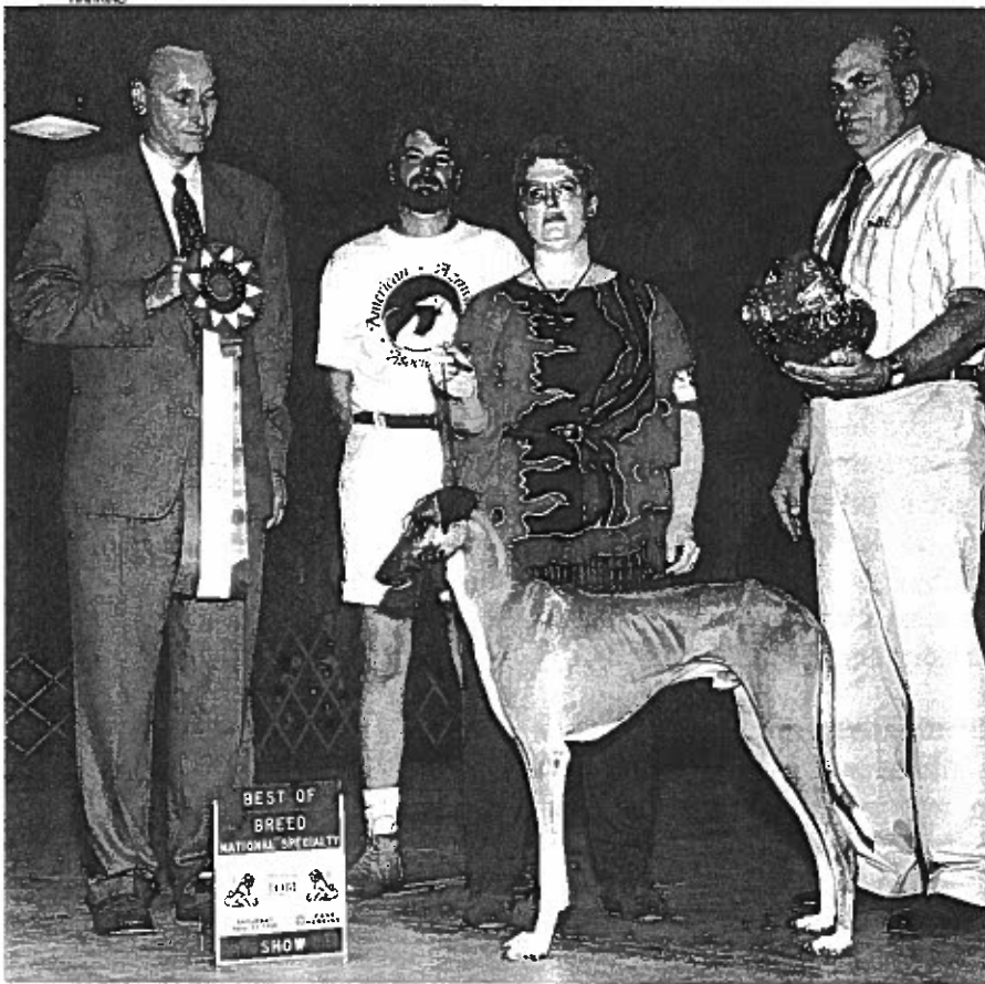
SBIS ARBA Jr. Grand Ch. Amastan Kel Air (German import)