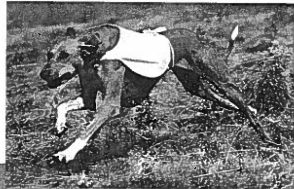
BISS ARBA Grand Ch. Kel Simoon Celie, FCC.