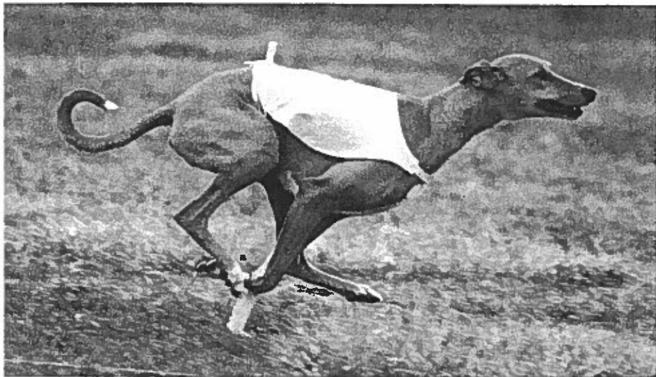
Multi SBIS UCI Int. Natl. Ch. Kel Simoon Cinnamon, FCC.