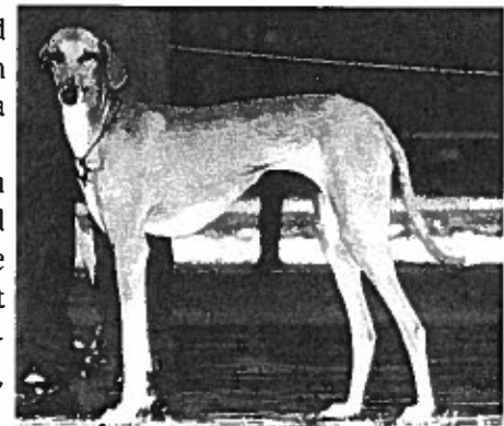
Above and opposite: BISS UCI Int. Natl. Ch. Kel Simoon Essari, FCC.